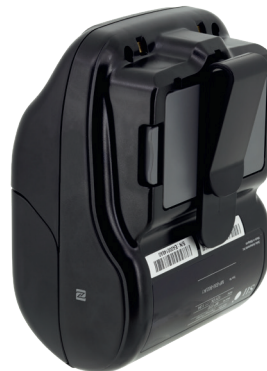
MP-B30L Belt Clip